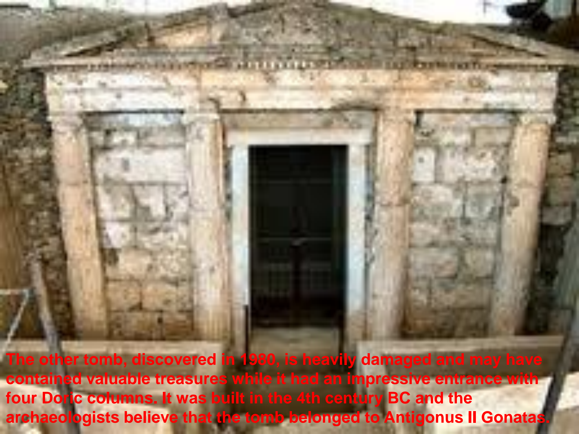
The other tomb, discovered in 1980, is heavily damaged and may have contained valuable treasures while it had an impressive entrance with four Doric columns. It was built in the 4th century BC and the archaeologists believe that the tomb belonged to Antigonos II Gonatas.